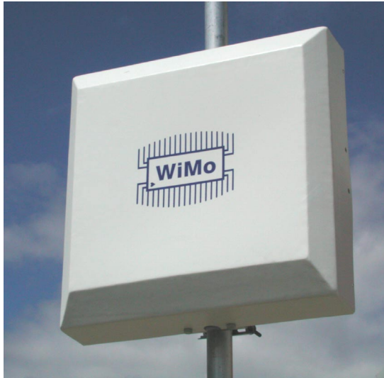
im Bild mit horizontaler Polarisation montiert

Flat panel antenna with radome for outdoor installations, 8 dBi gain. Includes mast bracket for a mast diameter of 25 to 50mm, connector N female. Size 45x45cm.