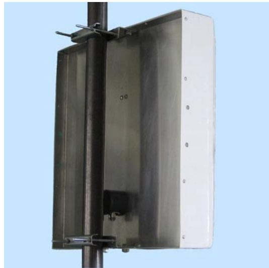
/ horizontal polarization if mounted as shown